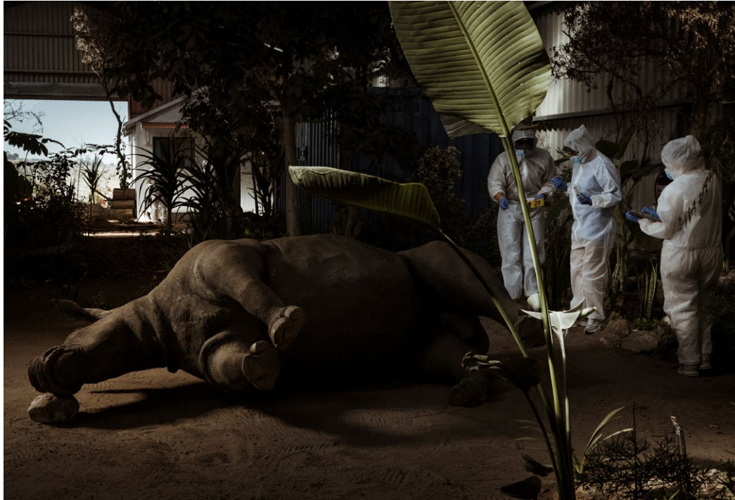
Students train at a staged wildlife crime scene in South Africa. AI-assisted forensic tools and data analysis are helping improve the investigation and prosecution of poaching cases.

Importantly, resistance to AI adoption – particularly within parts of the conservation sector and among some non-governmental organizations (NGOs) – reflects this gap between technology and clearly defined use cases. If AI is perceived as abstract, imposed or misaligned with operational realities, it is likely that its uptake will remain limited. 14 Demonstrating concrete, problem-driven use is therefore not only a technical requirement but a strategic entry point for broader adoption.