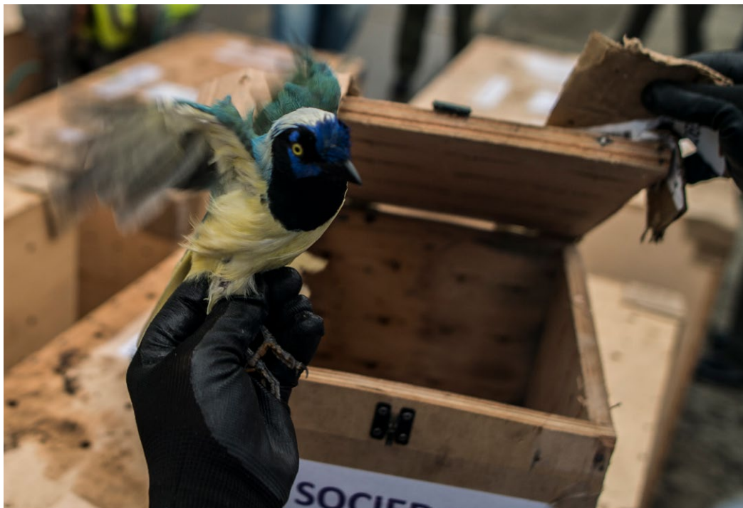
A biologist holds a magpie querequerre as rescued wildlife – victims of illegal trafficking – are prepared for release in Colombia. AI-driven monitoring and data analysis are increasingly used to detect and disrupt such crimes.

This report is informed by a workshop convened by ECO-SOLVE in Bangkok, Thailand, in January 2026. The event brought together 26 stakeholders from government, civil society, academia, and the private sector to explore the application of AI in monitoring and enforcing environmental crime. The insights generated through these discussions were further complemented by targeted consultations with additional stakeholders and a review of relevant English-language literature.