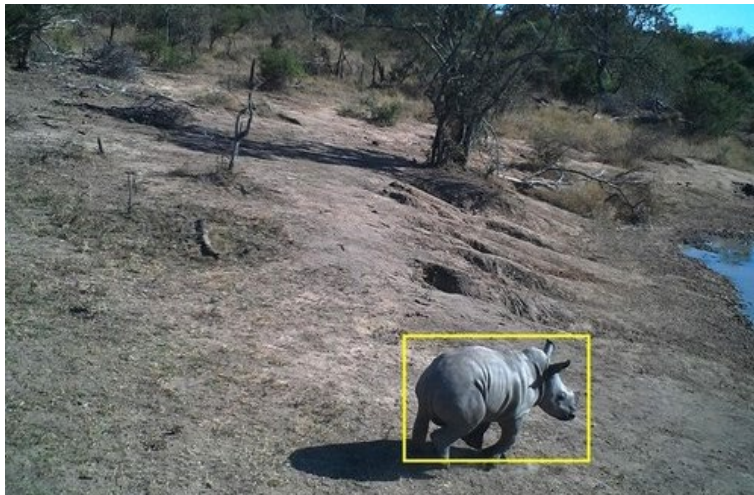
Images captured by wpsWatch, an AI-enabled monitoring system that supports real-time detection of wildlife crime in protected areas.

At scale, the system processes approximately 40 000 images per day across thousands of cameras and has contributed to more than 1 000 detections, leading to several arrests. WpsWatch demonstrates how AI-enabled sensor networks can extend monitoring coverage, accelerate detection and enable faster, more targeted responses to wildlife crime.