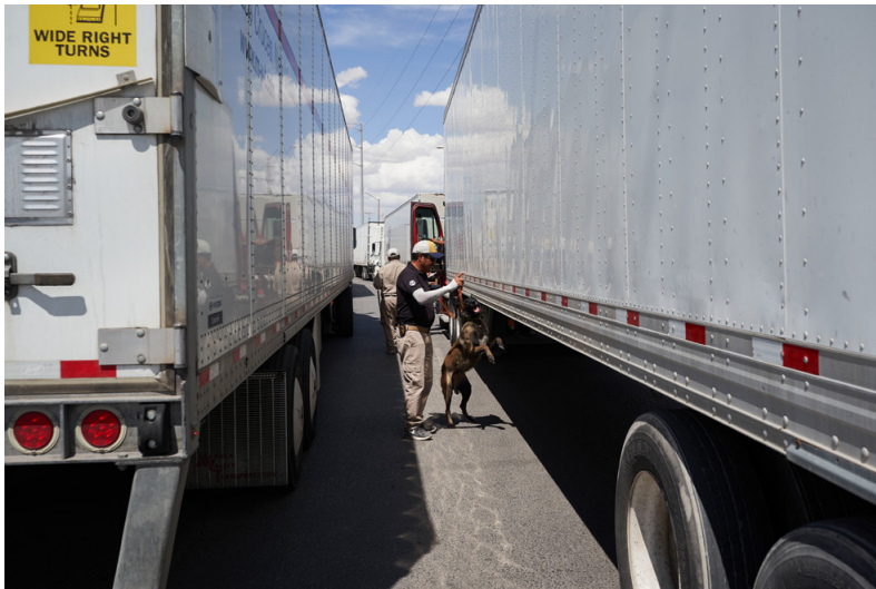
A security guard inspects trailers on the US–Mexico border, a major convergence point for drug trafficking routes and irregular migration.

trafficking, due to increased migration flows starting in the Darién Gap and compounded by migrants from the Northern Triangle and other parts of the world, such as China, India and Pakistan. 242