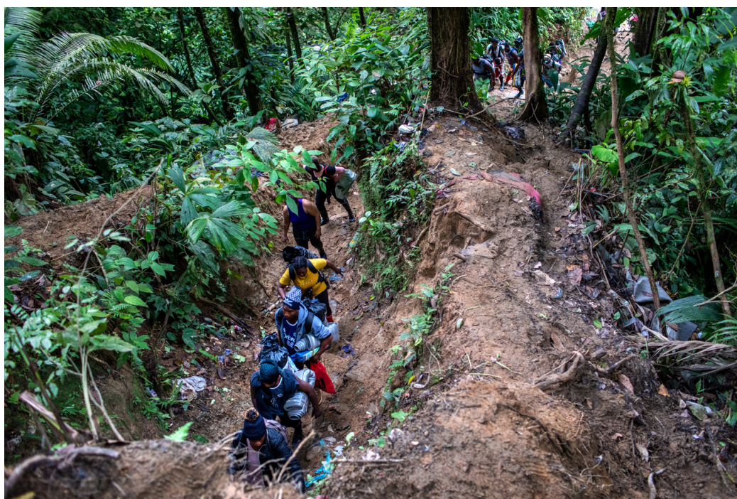
Migrants heading to the United States through the Darién Gap – one of the world's most dangerous migration corridors – often face extortion from criminal groups.

The Darién Gap is a critical point. This treacherous jungle between Panama and Colombia serves as a transit point for migrants seeking to reach the United States or Canada. Here, Panamanian gangs, criminal groups inside the Panamanian border police and the EGC are deeply involved in human and drug trafficking. 154