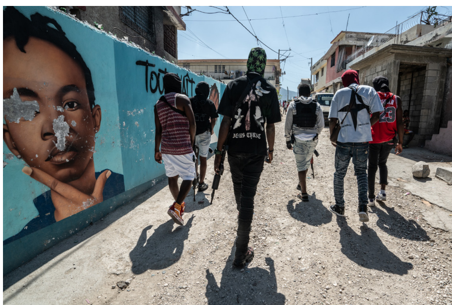
Gang members patrol the streets in Port-au-Prince, Haiti. Gangs now control approximately 85% of the capital and have effectively supplanted state institutions, resulting in a state of near-total lawlessness.

A distinctive feature of the Latin American context is the increasing tendency of criminal groups to assume territorial control and governance functions, especially in border areas where the state lacks