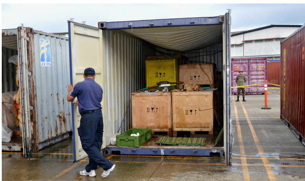
A weapons cache seized in Colón, Panama. Maritime ports in Latin America suffer from high levels of corruption and play a central role in enabling illicit financial flows.

Environmental commodities are increasingly central to trade-based IFFs. Gold from Colombia, Bolivia, Venezuela, Peru and Ecuador is systematically laundered through falsified origin declarations and exported to global markets, often through Chinese-linked intermediaries. 203 In Brazil, cattle and soy linked to illegal deforestation are laundered into global supply chains through asset fabrication schemes, such as falsified land titles and animal transport documentation. 204