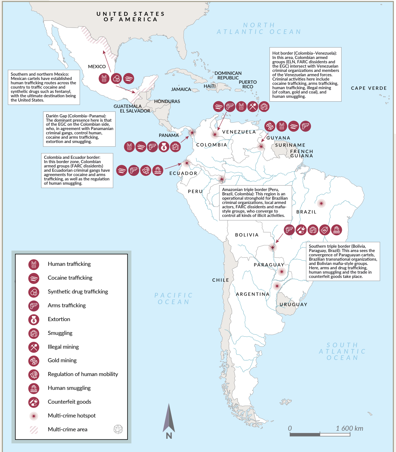
FIGURE 7 Multi-crime hotspots in Latin America.

Additionally, the CV is a major governance actor in Manaus. The group is the primary political authority across the densely populated neighbourhoods of Manaus's urban margins. The CV has established electoral alliances in Manaus, allowing candidates to campaign in CV-held territory in exchange for the delivery of infrastructure projects and housing developments. 219