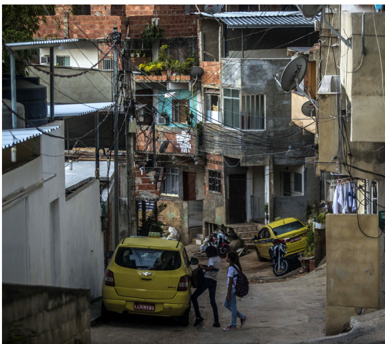
Police-backed militias now dominate many of Brazil's major cities, including Rio de Janeiro, where they control a third of the population.

In Brazil, extortion and protection racketeering are specialties of police-backed criminal groups known as militias. Composed mostly of off-duty or retired police officers, militias now rival large drug trafficking organizations like the CV and the PCC with regard to controlling illicit markets and exercising criminal governance in the margins of many major cities, including Rio de Janeiro, Boa Vista and Belém. 185 The bulk of militias' revenue comes from weekly protection fees imposed on residents and local businesses within their territories. In Rio – Brazil's second-largest city – more than 2 million people, or roughly one-third of the population, currently live in militia-controlled neighbourhoods. 186