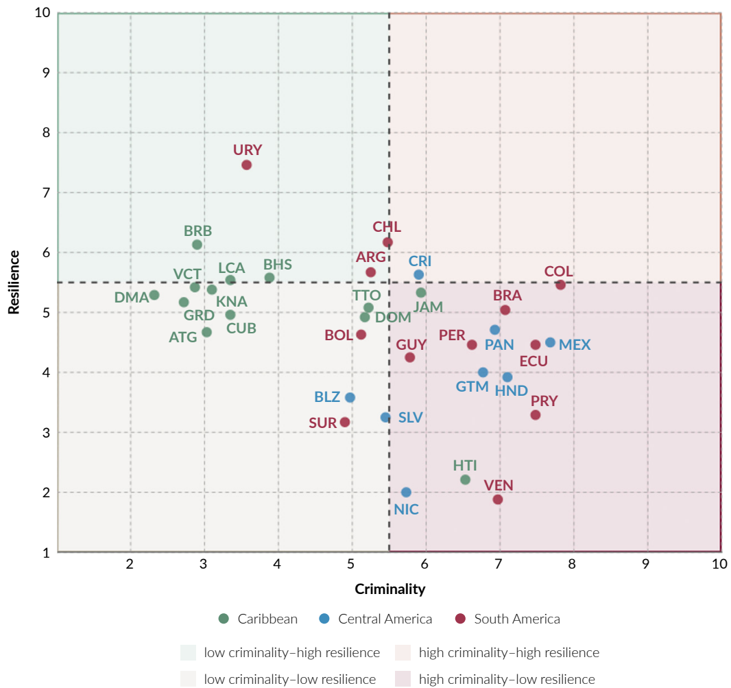
FIGURE 1 Vulnerability classifications of Latin American and Caribbean countries.