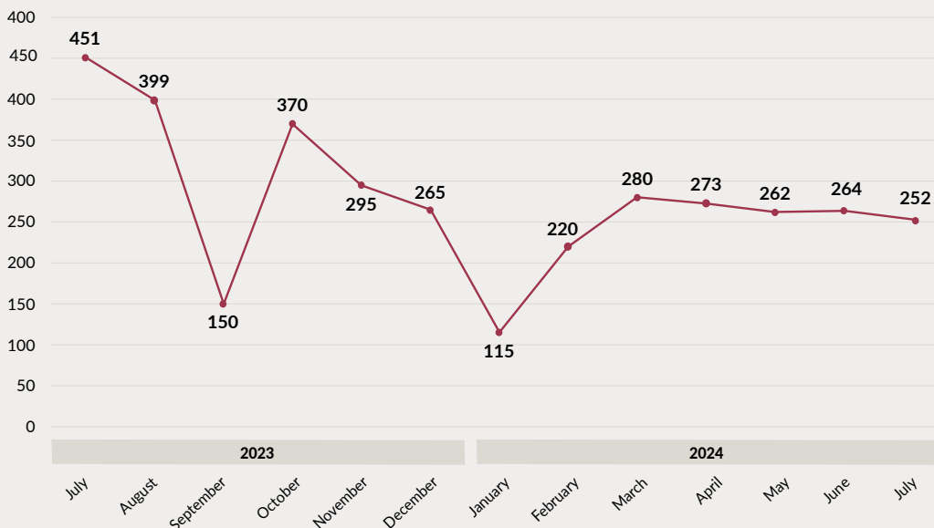
Number of gang violence incidents recorded Cape Town, July 2023 to July 2024.

All three of these incidents, as is the case with much gang-related violence in Cape Town, 53 highlight the ease with which gangs are able to access firearms and ammunition. In the extortion economy, there is a cycle in which profits are used to buy more guns, enabling the gangs to grow their territories, and so the pattern continues. 54 The cycle of drugs and firearms follows a similar pattern in other areas of the Cape Flats. Additionally, firearms are being assigned to gang members for them to carry permanently, as opposed to the past where they would have to return the weapons after having completed a specific task for the gang. 55 This new trend was initially introduced by the Fancy Boys gang in a bid to recruit gang members, and it appears that it has since been adopted by other gangs. 56 According to a gang expert, the fact more gang members are carrying firearms means that altercations between rival gangs are more likely to result in shootings. 57