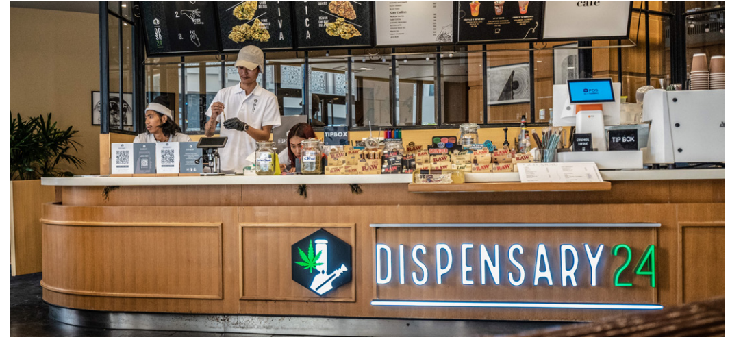
Cannabis 'dispensaries' in Thailand are perceived by local cannabis users as primarily targeting foreigners, particularly the tourist market.

The majority of people who use cannabis interviewed in the context of this project indicated a preference for cannabis to remain legal for recreational purposes, but the vast majority also agreed on the need for additional controls and safeguards to support a sustainable market.<sup>64</sup> The suggestion that additional public education was urgently needed to ensure that political, social and legal debates were grounded in evidence was repeated by several respondents across different groups, including people who use cannabis,<sup>65</sup> dispensary operators,<sup>66</sup> public health officials,<sup>67</sup> NGO representatives.<sup>68</sup> and even public security representatives.<sup>69</sup>