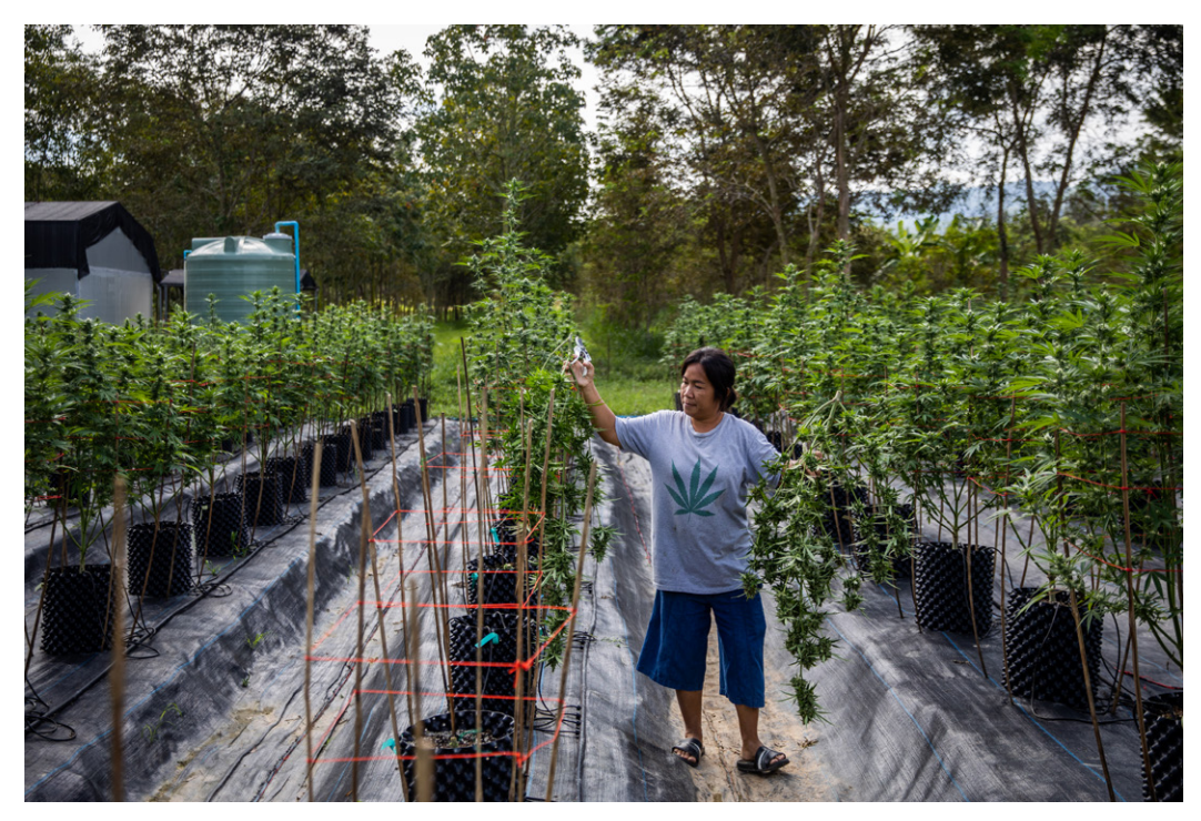
A marijuana and hemp farm in Kanchanaburi. Agricultural production in the country has benefited from government stimulus.

At present, there are no good manufacturing practices to guide cultivation and to reduce health risks for consumers and growers. Although there is no official research on the chemical contents of cannabis plant products in Thailand, anecdotal evidence indicates that they may be contaminated with a wide variety of insecticides and fungicides containing toxins. Despite the risks, these concerns were not verbalized in any of the qualitative interviews that were conducted.