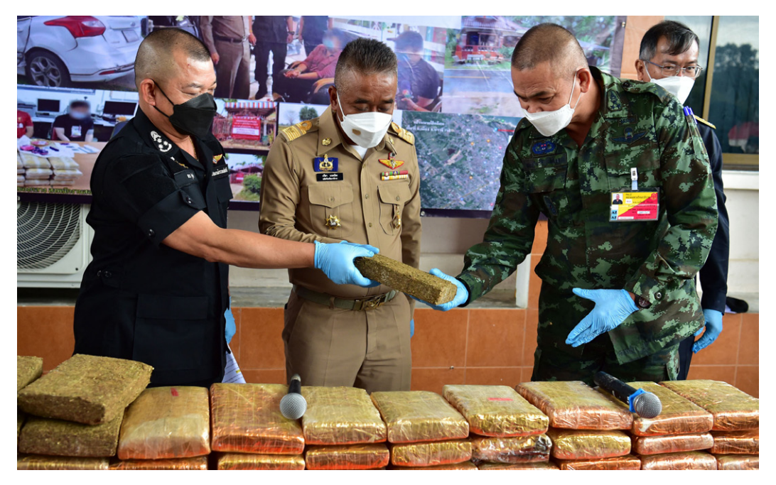
The Thai government has not succeeded in controlling effectively the liberalized cannabis market since reforms, with risk that illicit market forces will encroach.

Despite their efforts, authorities in those jurisdictions have not been able to achieve their goals: up to 40% of cannabis consumers in Canada, <sup>155</sup> 40% to 60% in Colorado, <sup>156</sup> and just below 80% in Uruguay <sup>157</sup> reportedly continue to purchase cannabis from the illicit market despite the presence of a well-established and regulated legal cannabis market. In the Netherlands, 'coffeeshops' continue to purchase their supply for legal sale from criminal actors (known as the backdoor problem). <sup>158</sup> The proportion of Thai cannabis consumers who continue to source plant products from the illicit market is unknown, and the current market structure – with the different cannabis markets bleeding into one another – is likely to make that assessment even more challenging.