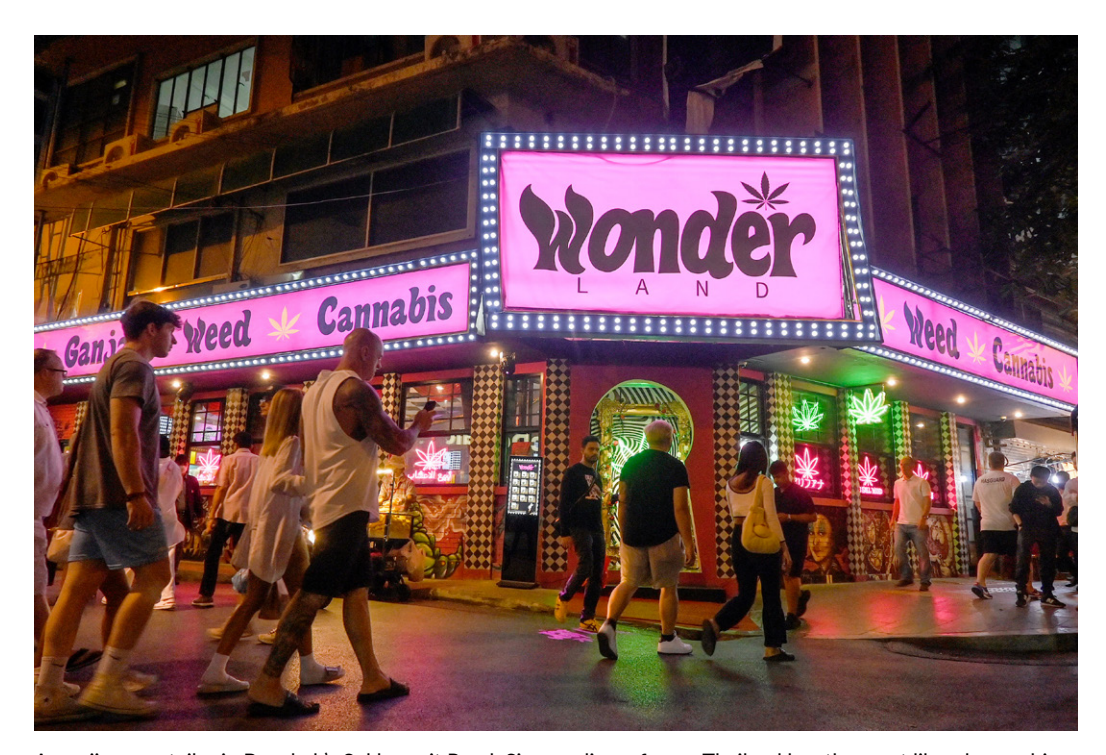
A marijuana retailer in Bangkok's Sukhumvit Road. Since policy reforms, Thailand has the most liberal cannabis market in the world.