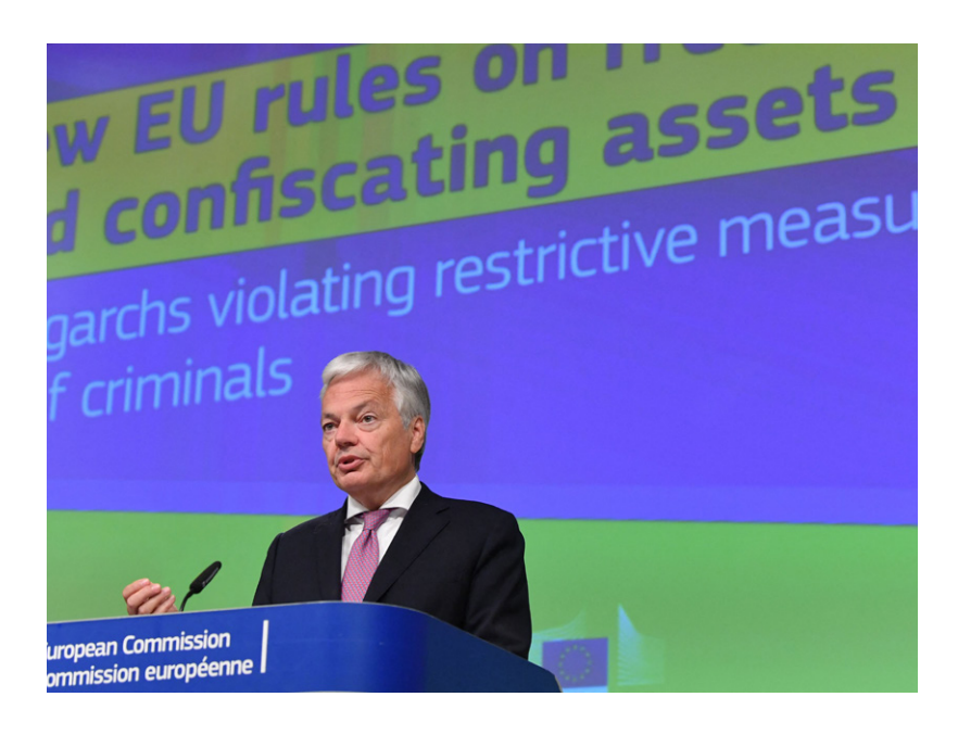
The EU Commissioner for Justice Didier Reynders speaks on new EU rules on freezing and confiscating assets of oligarchs violating restrictive measures and of criminals at the EU headquarters in Brussels, May 2022.

Provide confiscated assets to countries impacted by transnational organized crime. Asset confiscation has increasingly come to the fore in the context of the Russia–Ukraine conflict, with proposals to seize sanctioned assets and provide the funds to Ukraine for the purposes of rebuilding. It seems likely that, if implemented, such initiatives could ultimately be extended to other types of foreign policy challenges, including transnational organized crime. The GI-TOC takes no position on the broader merits of such proposals. However, if undertaken, assets confiscated from criminal actors, whether through post-conviction confiscation, non-conviction-based confiscation or voluntary forfeiture, should not stay with the confiscating government, as is the current norm. Rather, confiscated assets should be channelled into supportive programmes in the countries where such actors primarily operate and where the harms of their criminal operations are concentrated, assessed in line with harm-based criteria. Programmes could include support for law enforcement, anti-corruption, regulatory and other development initiatives. This would provide tangible benefits both for governments impacted