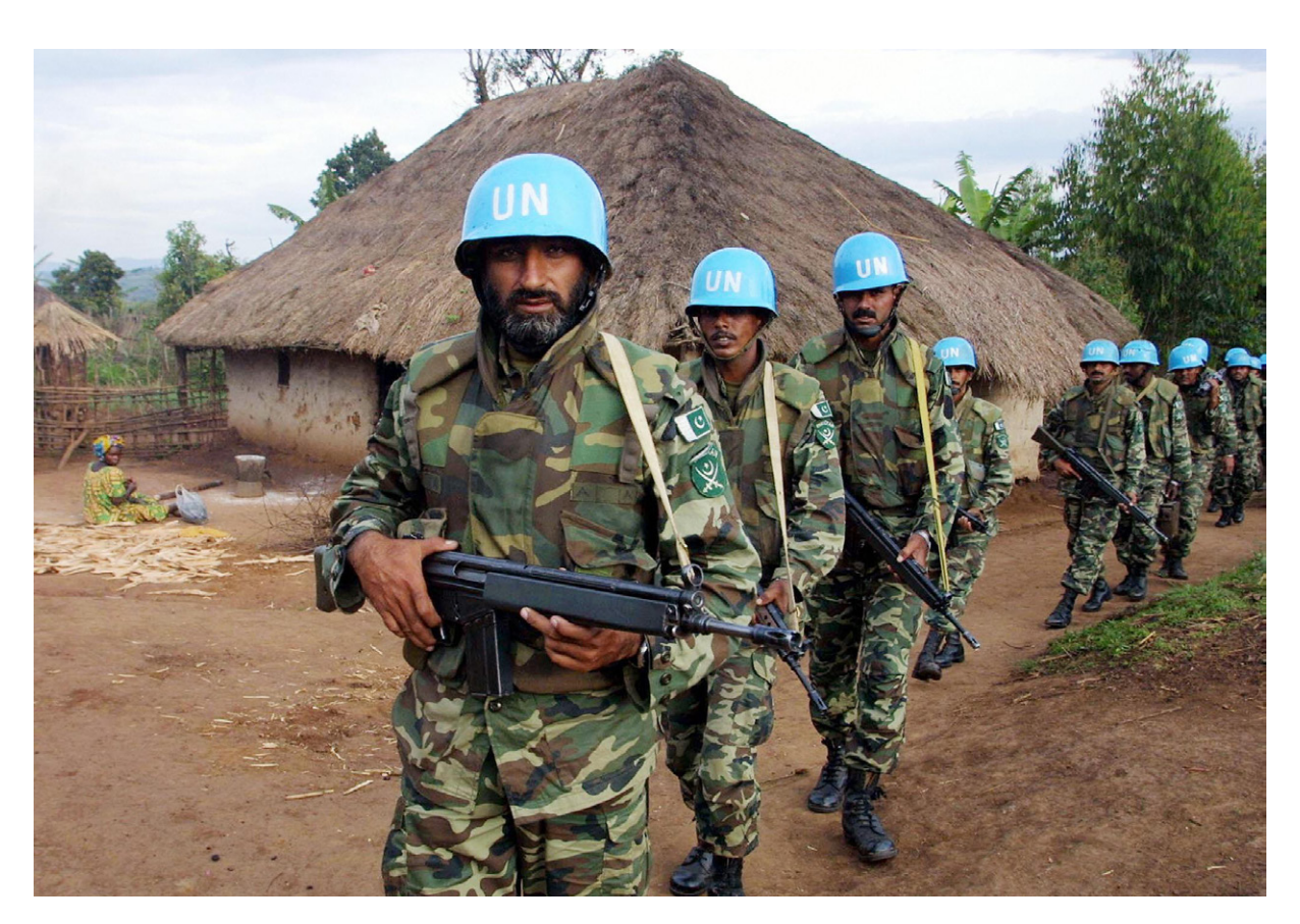
UN peacekeepers arrive in Kachele, DRC, October 2003.

With the establishment of the Haiti sanctions regime in October 2022, the UN went further. The criteria in that regime recognized that criminal gangs and networks were the primary threats to peace and allowed for the designation of those involved in or supporting criminal activities, including human