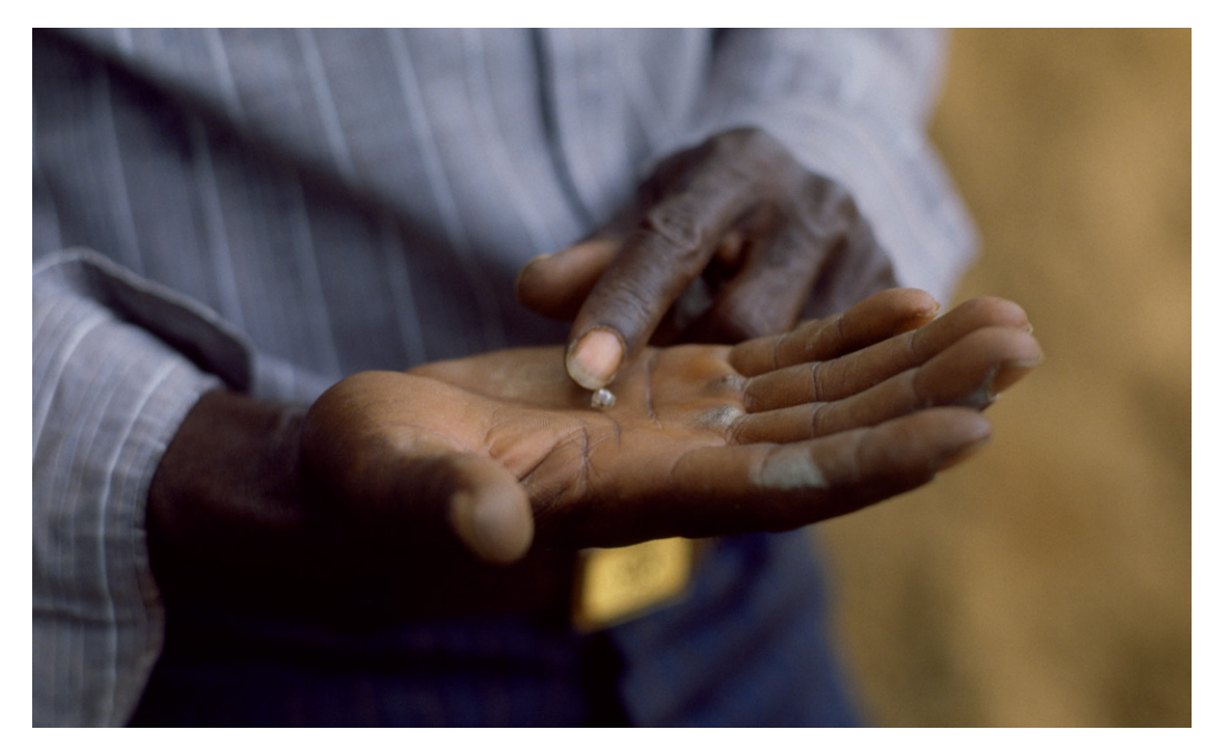
Close-up of a diamond in Sierra Leone. The rising profitability of organized crime has had a substantial impact in the states in which networks operate.

designate criminal actors for allegedly contravening human rights norms rather than involvement in organized criminality per se.