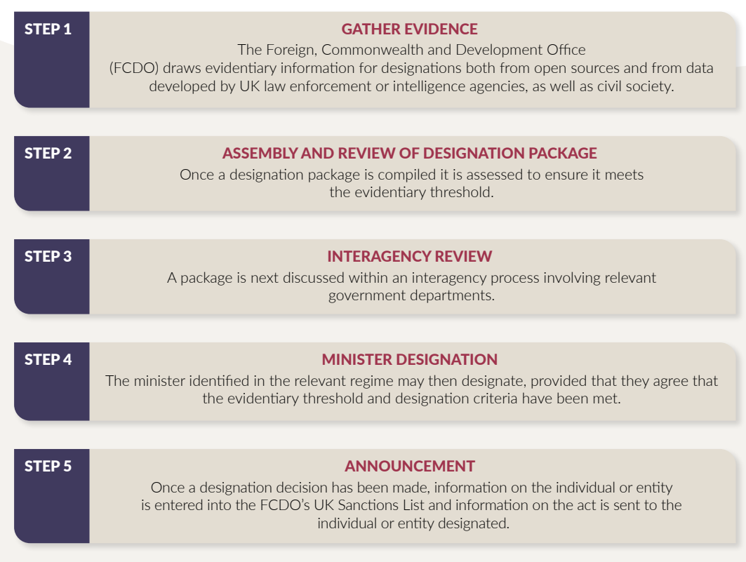
FIGURE 8 Process of UK designation development.

The UK previously was a key part of the broader EU restrictive measure process, often providing key information and legal support. Since Brexit, the UK has established a new set of processes for sanctions development and implementation. Responsibility for sanctions within the UK system is not unified, with several ministries directly involved. The Foreign, Commonwealth and Development Office is responsible for the development of designations and broader sanctions policy. Implementation of sanctions involves a range of ministries. The two most important for targeted measures against organized crime are the Home Office and the Treasury. The Home Office is responsible for visa sanctions, with powers afforded to it by the 1971 Immigration Act.<sup>32</sup> The Treasury's sanctions unit is the Office of Financial Sanctions Implementation (OFSI), which is tasked with implementing targeted financial sanctions, overseeing adherence to them and ensuring that private sector financial institutions are aware of their roles and responsibilities.<sup>33</sup>