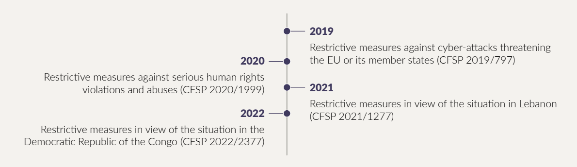
FIGURE 3 Select EU sanctions regimes targeting organized crime.

The EU has also increasingly adopted horizontal sanctions regimes that target discrete thematic issues with global applicability. Two of these, against cyberattacks and human rights breaches, have salience for organized crime, with the latter explicitly allowing for the designation of those involved in the 'trafficking in human beings, as well as abuses of human rights by migrant smugglers'.<sup>12</sup>