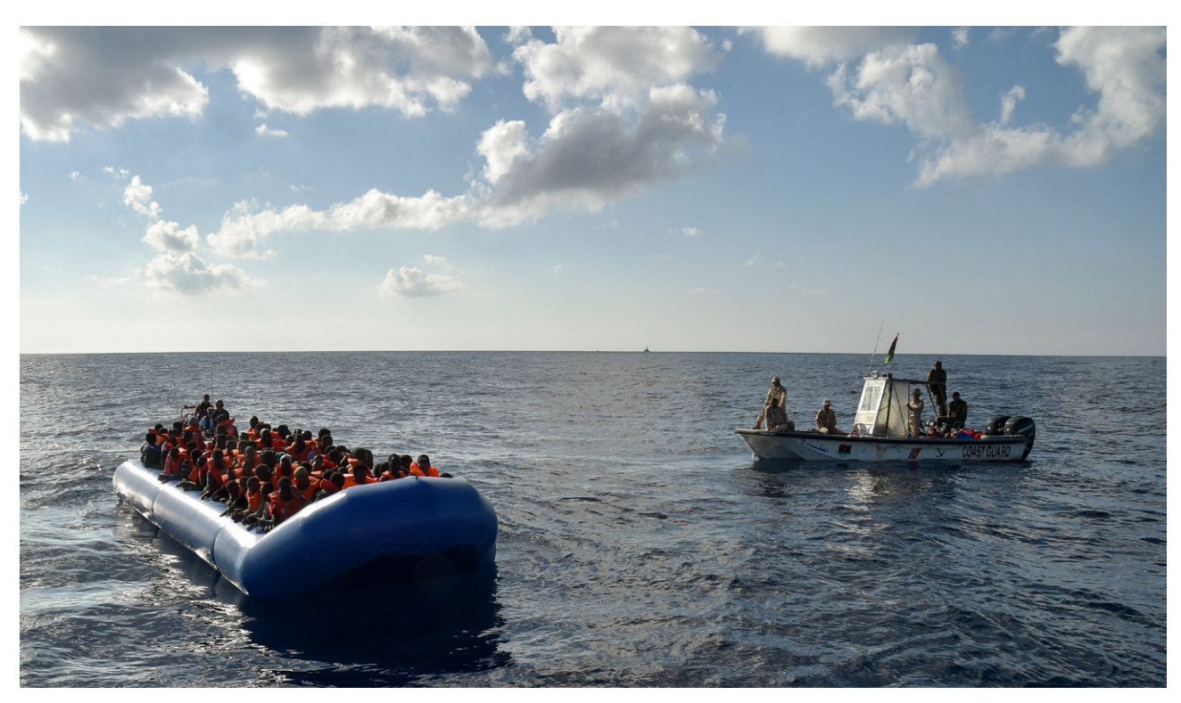
A migrant rescue operation off the Libyan coast, 2016. In 2020, the EU sanctioned a reported human smuggler in Libya.

Nonetheless, sanctions can be, and often are, delayed due to capacity gaps among member-state delegations, wrangling over evidentiary issues or purposeful delays in review by a member state.<sup>29</sup> Pushback by member states on proposed designations is common, especially if particular foreign policy or commercial interests are impacted by the proposed listing.<sup>30</sup> In turn, the negotiations inherent in the process and the ability of member states to hold up proposals they object to shape the nature of designations and restrain the speed with which they can be developed.<sup>31</sup>