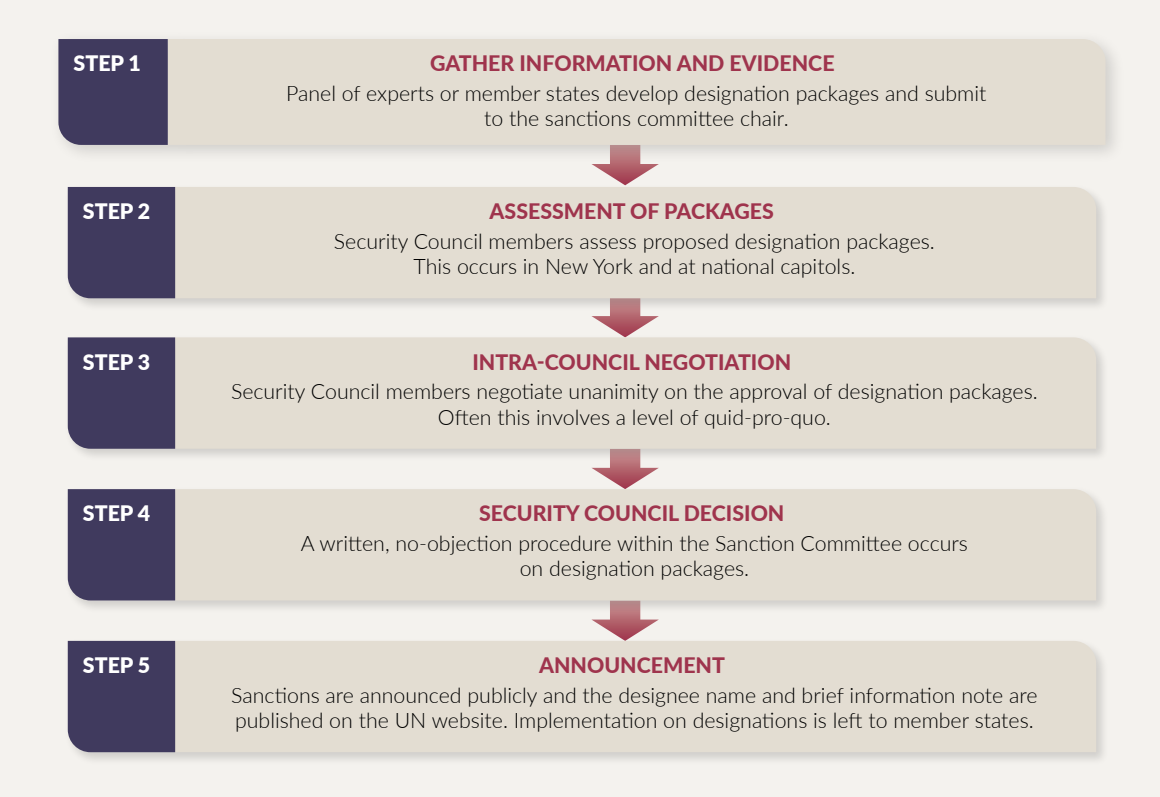
FIGURE 6 Process of UN designation development.

Designations, however, only occur if there is unanimity among committee members. Sanctions decisions are often held up or opposed not just on the basis of evidentiary concerns, but also on ideological or national interests by states on the committee. Because of the opaque nature of sanctions committees, and the Security Council more broadly, support for and opposition to specific designations