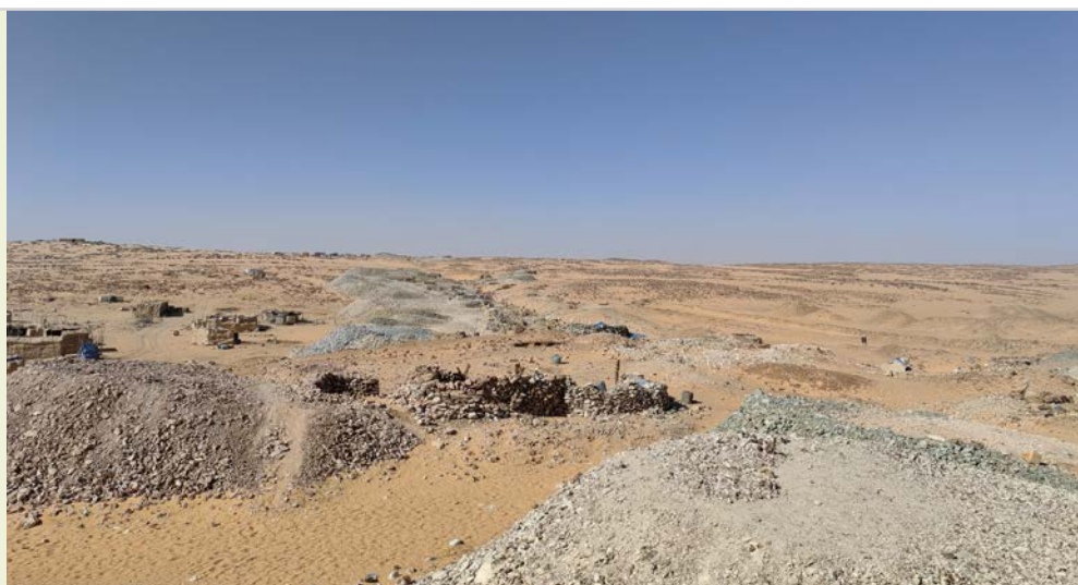
View from a gold-mining site in Djado goldfield, Niger, June 2022

In N'Tahaka, as highlighted above, security actors – that is, groups operating under the CSP – are seen by some gold miners to play an active role in exacerbating rather than addressing human-trafficking and exploitation risks. In the absence of formal local governance, gold mining is governed entirely by armed groups. Yet interviews in N'Abaw, where the goldfield is under the control of JNIM, suggest that security actors there actually help to address such risks. Although these testimonies should be treated with caution, some suggest that the religious governance system implemented by JNIM – although in many other regards a driver of conflict and violence – may contribute to reducing the vulnerability of workers by providing and enforcing a strict moral regulatory framework. 151