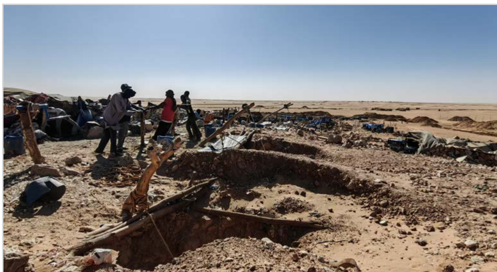
Artisanal gold miners in Tchibarakaten, Niger, July 2022

In the latest electoral census, in December 2019, the municipality of Iferouane (an oasis town located some 300 kilometres south of the goldfield and the municipality under which it falls) counted 11 000 registered voters, of whom 2 000 were registered in Tchibarakaten (including gold miners and military personnel). 86 But, according to the former mayor of Iferouane, the current population of Tchibarakaten may be between 30 000 and 40 000 people. 87 Constant fluctuations of people leaving and entering the sites make it difficult to develop reliable population estimates.