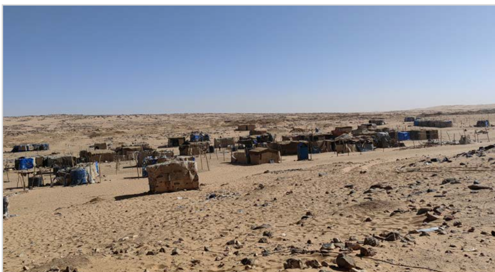
Makeshift shelters in Tchibarakaten, Niger, July 2022

However, gathering evidence for such practices is challenging. One gold miner told the GI-TOC that, despite widespread examples of abuse, few gold miners are prepared to speak out about the conditions imposed by