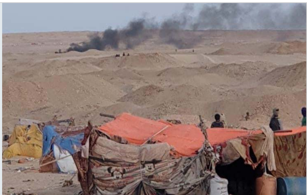
Gold-miners' shelters are set on fire as intercommunal violence escalates in Kouri Bougoudi, Chad, May 2022

Gold discoveries in Mali instigated a new economic dynamic in the mining areas, providing alternatives to criminal activity. 31 Exact figures of the number of people employed at gold sites are impossible to obtain, but some estimates put the total number of artisanal gold