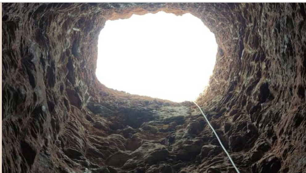
View from inside a gold-mining shaft in N’Tahaka, Mali, August 2022

Like all gold mining in northern Mali, gold mining at N’Tahaka is informal and includes artisanal and semi-mechanised operations. Gold-mining activities reportedly began around 2018. Estimates of the number of gold miners at N’Tahaka are vague, but several interviewees believe up to 10 000 miners were working there in late 2022, including local communities from the Liptako Gourma region (Maliens, Burkinabes and Nigeriens), but also migrant workers hailing from Sudan, Nigeria, Chad, Liberia, Ghana, Mauritania, Senegal, Guinea, Togo and Algeria. 95