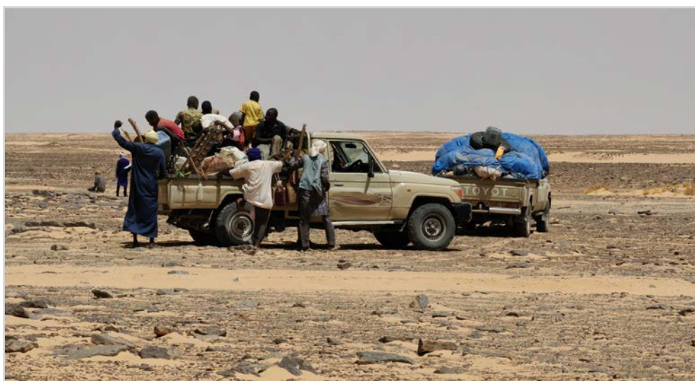
Gold miners transported from Arlit to Tchibarakaten, Niger, July 2022

This geographic factor is more significant for remote goldfields like Tchibarakaten (400 kilometres from Arlit) and Djado (650 kilometres from Agadez) than those located closer to major towns and cities, such as N'Tahaka (50 kilometres from Gao). 122 However, interviewed gold miners in N'Tahaka reported having travelled on credit to the goldfield from further afield than Gao. Transport debts for gold miners in N'Tahaka can reportedly range between FCFA 200 000 and FCFA 500 000 (€305–€762).