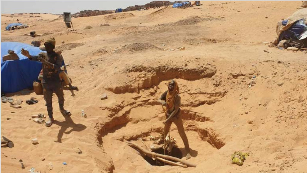
Gold miner in Djado, Niger, June 2022

Such labour agreements often turn into further exploitation as workers are exchanged between gold-site owners. Gold miners are not free to end their employment at the gold mine and their attempts to escape expose them to risks of violence and reprisal from their employers. 64