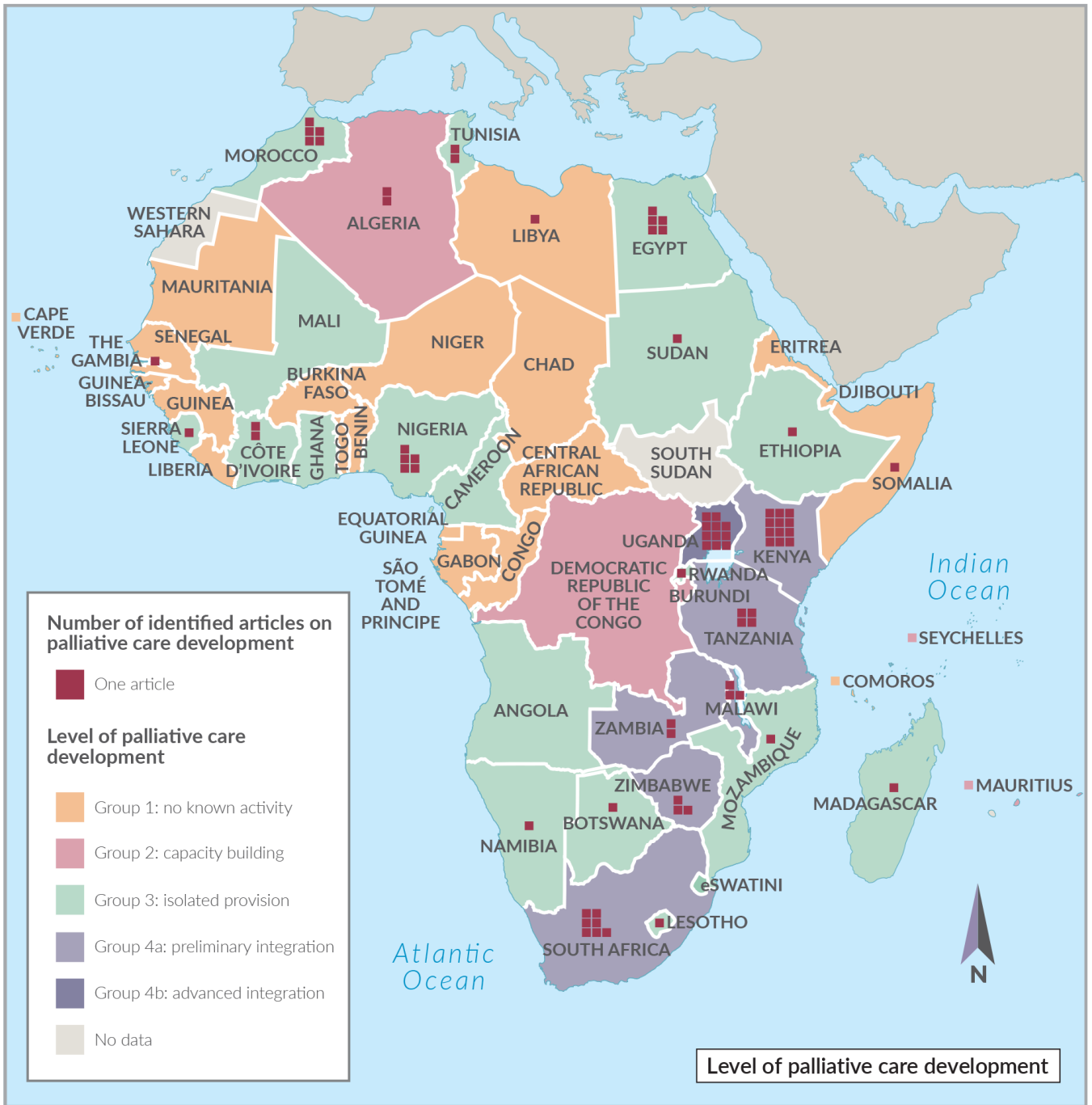
FIGURE 2: Level of palliative care development.