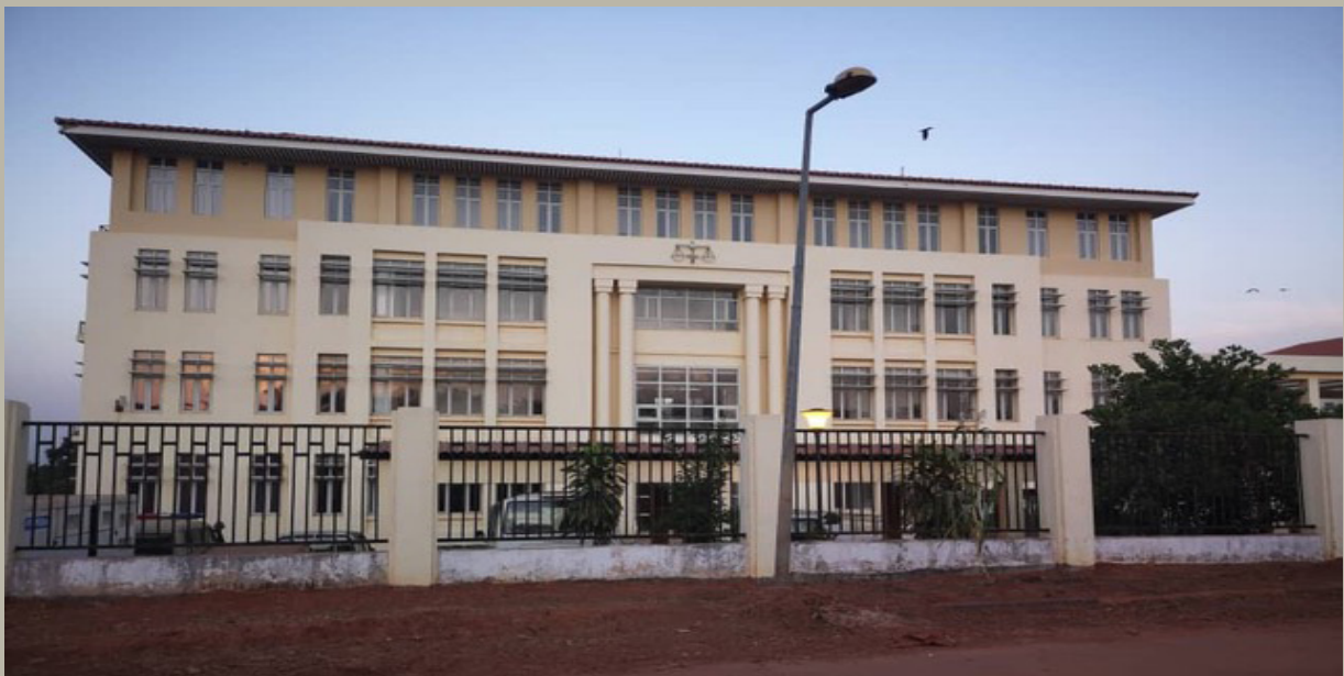
A judgment in Guinea-Bissau's Court of Appeal drastically reduced the sentences of the co-accused ringleaders in the August 2019 cocaine-trafficking deal.

The appeal court found all defendants guilty of drug trafficking, but that the lower court had erred in its convictions on the offence of 'criminal association' (i.e. belonging to an organized-crime group, broadly as defined under the UN Convention on Transnational Organized Crime) and money laundering. Judge Aimadu Sauané issued a dissenting judgment in which he disagreed with the two remaining judges on the overturning of criminal association