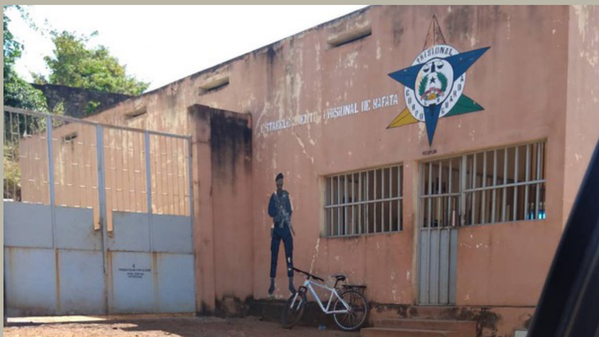
Bafata Prison, Guinea-Bissau. The two ringleaders uncovered in the September 2020 Operation Navarra have evaded imprisonment.

Notably, after the sentence was handed down, the convicted defendants were held in a detention centre in Bissau, with two exceptions: the ringleaders, who were never arrested.