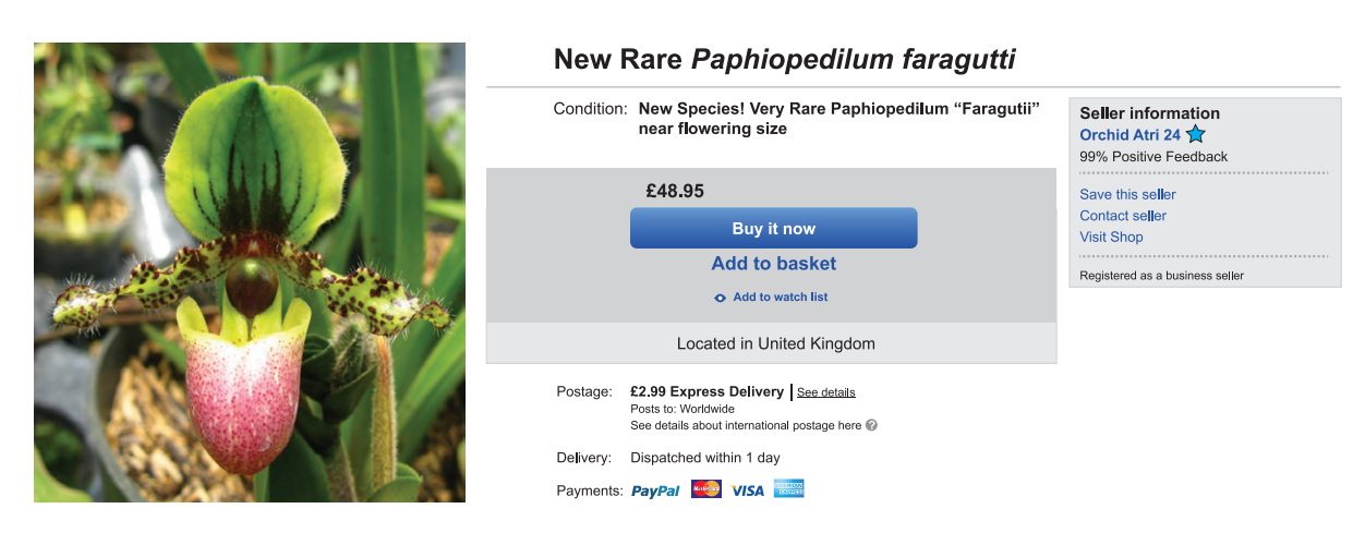
Figure 2: Mock-up of a typical orchid advertisement on an e-commerce platform. 'New species', 'very rare' and worldwide shipping are indicators of illegal activity.

Figure 2 shows screenshots of an orchid being marketed on an e-commerce platform, depicting a clearly labelled wild plant of a CITES Appendix I listed species available for worldwide shipping.