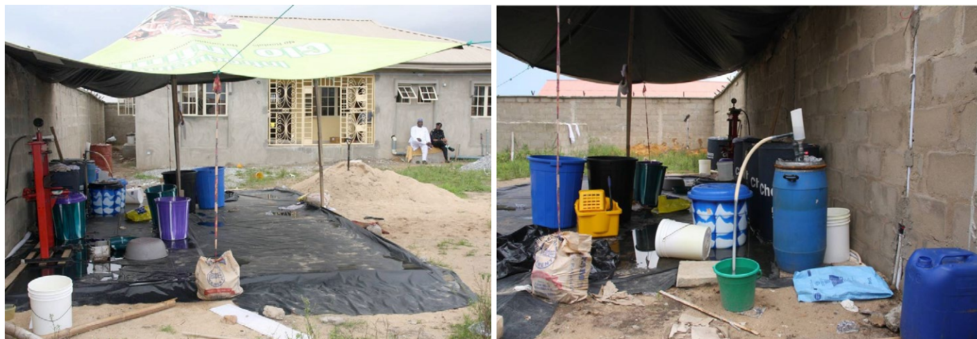
CLAN LAB: Nigerian agents stumbled across this meth lab in Lagos in 2010. At the time, the National Drug Law Enforcement Agency (NDLEA) had no experience of methamphetamine.