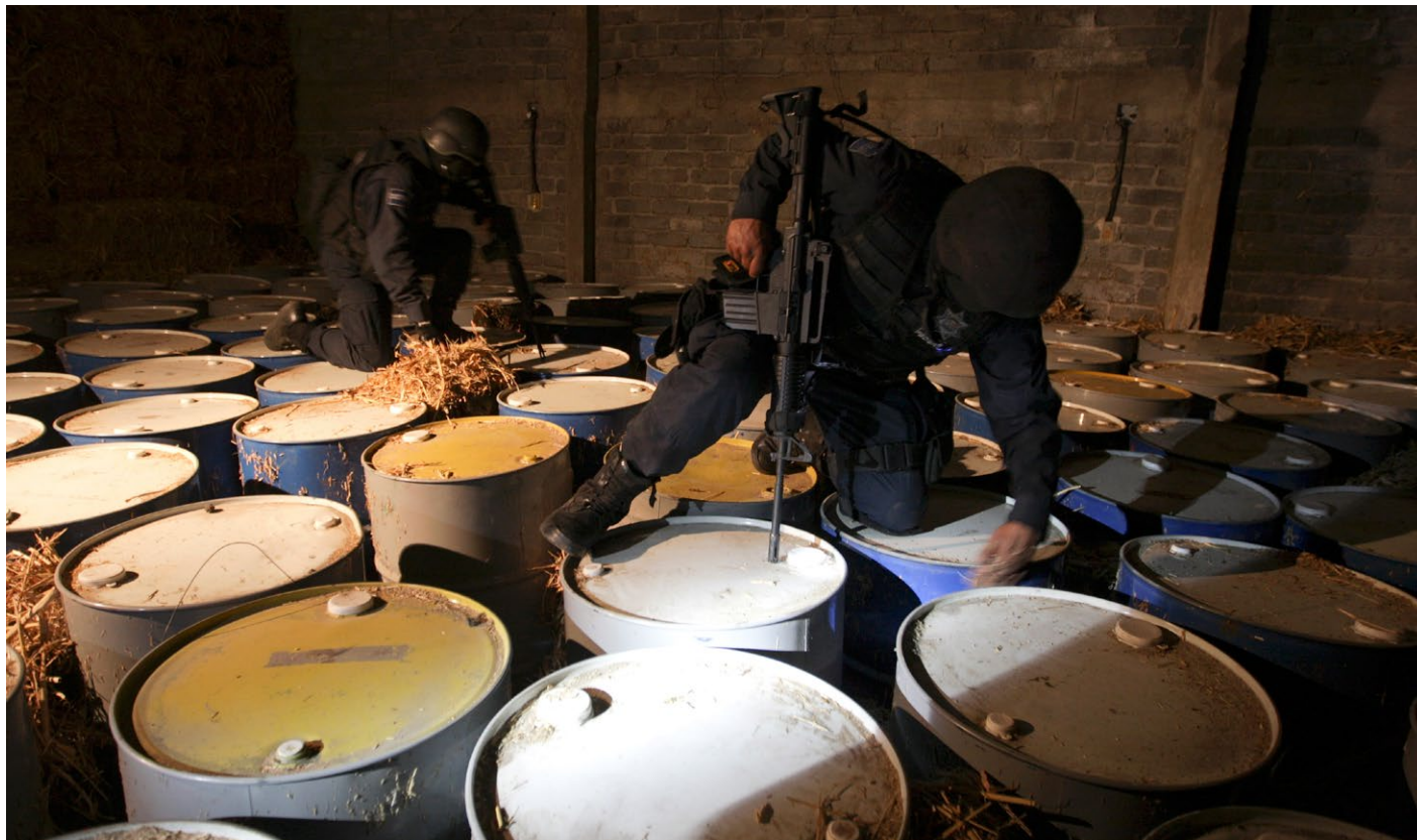
FORCES NEEDED: America's Drug Enforcement Administration (DEA) is helping African officials detect and dismantle clandestine labs. In this 2009 picture, federal policemen raid a Mexican cartel.