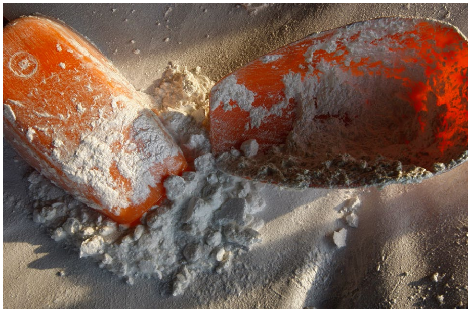
MEXICAN CONNECTION: Latin American gangs are providing know-how to West Africa based on clandestine labs like this one in Zacoalco de Torres, Mexico, in 2011. Cover: Methamphetamines seized by police at the Malian border in Senegal in 2014.

Climate dictates where cocaine, heroin or hashish are produced, but there are no such constraints on meth. The synthetic drug is derived from ephedrine or pseudoephedrine, two medicines that are used to treat ailments from nasal decongestion to asthma. As anyone who has seen the television series "Breaking Bad" knows, meth can be manufactured even with basic equipment and a simple understanding of