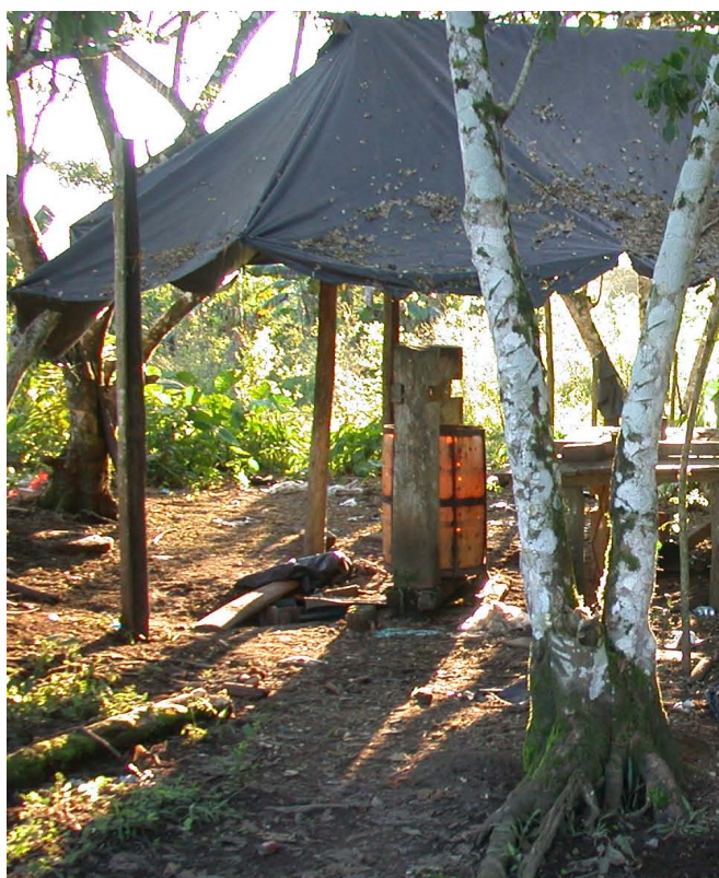
A coca processing "lab" in Colombia. The toxic chemicals used in the production of illicit drugs are often dumped into jungles, natural water sources or forests