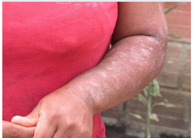
A skin rash caused by herbicides sprayed from fumigation planes

“There is credible, reliable evidence that the aerial spraying of glyphosate along the Colombia-Ecuador border damages the physical health of people living in Ecuador. There is also credible, reliable evidence that the aerial spraying damages their mental health.” (20)