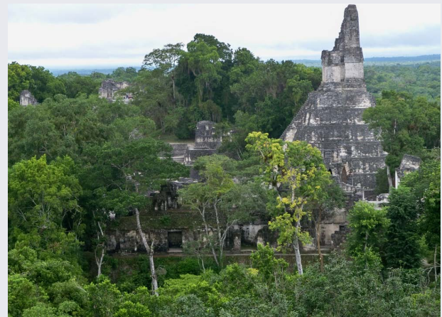
Drug traffickers have effectively taken control of protected areas in Guatemala

“Organized crime and drug traffickers have usurped large swaths of protected land amid a vacuum left by the state, and are creating de facto ranching areas. We must get rid of them to really have conservation.” (34)