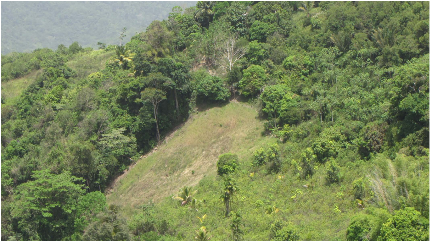
Drug war enforcement measures are driving drug crop producers to seek out new, more secluded land in ecologically valuable rainforests