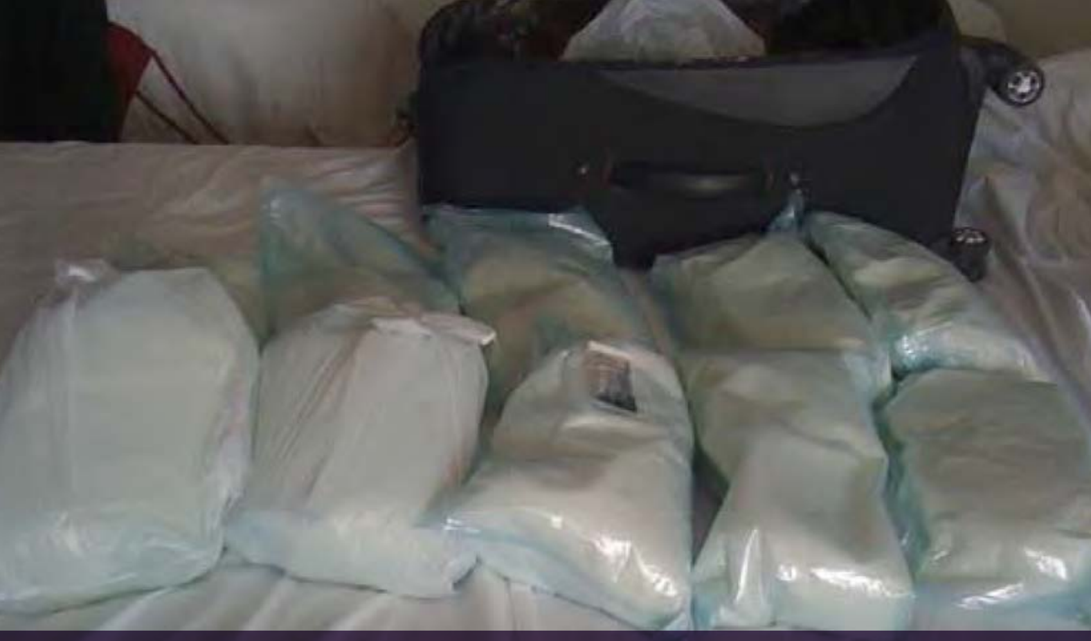
Thai police seized approximately 20kg of methamphetamine believed to be of North Korean origin on 29 October 2012.

recent 2016 report stated that "[t]here is insufficient information to determine whether DPRK state entities are currently involved in the production or trafficking of methamphetamine or other illicit drugs". "The absence of incidents over the past decade could indicate either curtailed state involvement in drug trafficking, or, alternatively, that the DPRK regime has become more adept at concealing its involvement."<sup>29</sup>