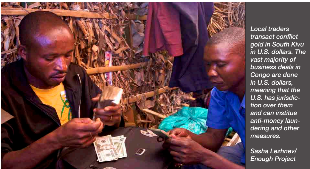
Local traders transact conflict gold in South Kivu in U.S. dollars. The vast majority of business deals in Congo are done in U.S. dollars, meaning that the U.S. has jurisdiction over them and can institute anti-money laundering and other measures.

to stop them because the transactions will likely transit through correspondent banks in New York. There is often concern that sanctions against individuals with assets outside the United States means that nothing can be done to enforce sanctions. As large penalties against major international banks in recent years have shown, this is incorrect, and designations can be more vigorously enforced in programs like Congo once more is known about the banking channels involved. In sum, a designation of a target with assets outside the United States can have significant impact because: