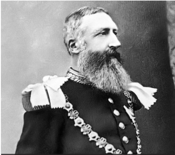
The first violent kleptocrat in Congo, King Leopold II. Between 5 and 10 million people were killed during his reign, while he stole an estimated $1.1 billion.