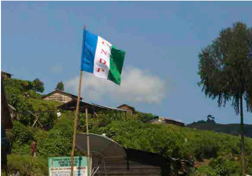
The former Rwanda-backed rebellion CNDP was integrated into the Congolese army on paper, but in reality acted as its own army from 2009 to 2012, flying its own flag and collecting its own taxes separate from the state. This photo was taken in 2010.