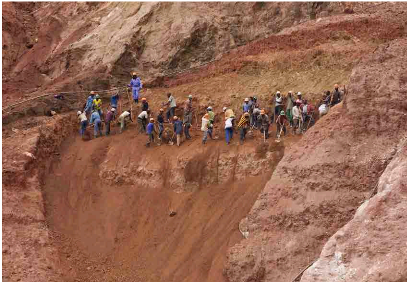
Artisanal gold miners earn between $2 and $7 per day, but they are subject to heavy extortion and taxation by the military and government officials.