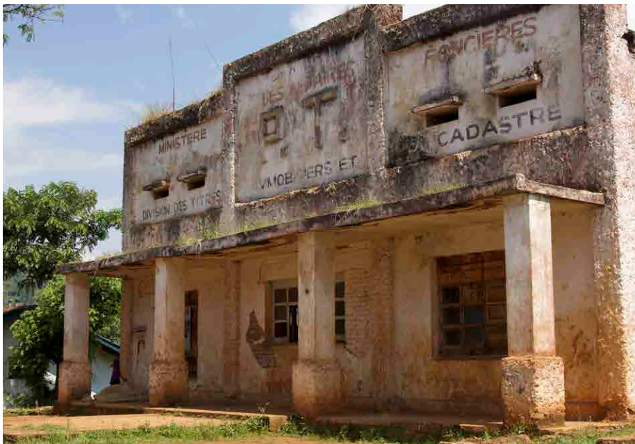
A government office in South Kivu. The hijacked state means that government services suffer greatly.

to selected local leaders and communities in order to reduce opposition to the state while simultaneously deepening competition between communities in order to prevent the emergence of a united local opposition." 20 This helps fuel conflict, as the military benefits from insecurity and lawlessness in maximizing profits, and local populations form defense militias in response. For example, United Nations experts estimated that $400 million worth of gold mainly from the conflict-affected east was smuggled out of Congo in 2013, benefiting abusive commanders, officials, and collaborators in neighboring countries. 21