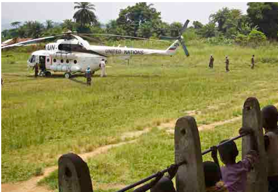
MONUSCO was effective against the M23 rebels, but the Congolese government manipulates the peacekeeping mission when it does not want to fight against groups that its army units collaborate with.

However, when the peacekeepers' mission is not politically suitable for the Congolese government, it actively prevents the U.N. peacekeepers from doing their jobs engaging in comprehensive peacekeeping, security sector reform, or playing a large role in supporting the "creation of an environment conducive to