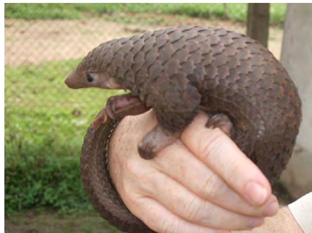
Pangolins, two species of which are endangered, are increasingly smuggled from Congo through South Sudan and Uganda.

The smuggling of another species, the pangolin, which is an endangered scaly mammal, also occurs in Uganda, and UWA officials appear to have been implicated in its smuggling at times. Pangolins are endangered, according to CITES, of which Uganda is a signatory. 114 There were a number of seizures and arrests for pangolin smuggling in Uganda in 2016 and into 2017, 115 which is a positive development. However, in 2014-15, an extensive arrangement for the collection of pangolin scales allegedly involving UWA officials likely led to pangolin poaching in the region. In the January 2015 ivory seizure at Entebbe’s airport described above, two tons of pangolin scales were also seized, hidden in cartons labeled as electronic equipment destined for the Netherlands. 116 The seizure’s timing was interesting as it coincided with a legal case concerning seven tons of pangolin scales destined for export to China. When the ivory theft from UWA stores became public, an article appeared in the Ugandan press claiming that the UWA executive director had issued a permit to a local dealer to export over seven tons of pangolin scales. 117