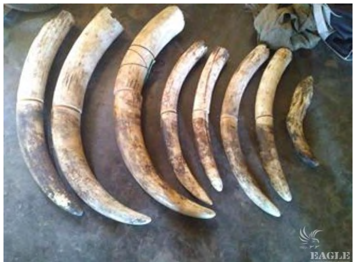
63kg (139 lbs) of ivory recovered from a bust in Uganda in February 2017 after the alleged smuggler attempted to bribe police.

In recent years, Uganda has become a major transit point in the global illegal ivory trade, according to CITES. 61 Uganda emerged as a wildlife trafficking risk in the CITES rankings in 2013, going from a country of secondary concern for ivory trafficking in 2009 to a country of primary concern in 2013 and remained so in 2016. 62 CITES noted in 2016 at its major international conference that Uganda was “an important entrepôt/export centre in East Africa with clear links to Central African ivory trade flows.” 63 The CITES report stated that since 2013, “organised criminal elements operating in Kenya, Tanzania and Uganda have continued to move large quantities of ivory into, between, and out of these three East African countries, which collectively constitutes the greatest illicit ivory trade flows out of Africa in the period 2009 through 2014.” 64