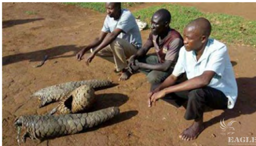
Three traffickers were arrested in Uganda with one live pangolin and two skinned pangolins. One of them is a police officer. April 21, 2017.

a small amount compared to wildlife that is smuggled out successfully. 69