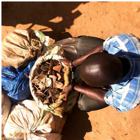
In a separate case, rangers from Congo's ICCN (Institut Congolais pour la Conservation de la Nature) and Garamba National Park, managed by the conservation NGO African Parks, intercepted an attempt to traffic 73 kilograms of illicit giant pangolin scales in February 2017.

According to a Ugandan lawyer, the Smico's owner was granted the license without a legal tender, an illegal act under Ugandan law. 122 In addition, UWA handed Smico over 150 kilograms (330 pounds) of pangolin scales from UWA stores even though some of the scales were exhibits in an ongoing legal case against pangolin poachers. 123 UWA priced the scales at $50 per kilogram ($23 per pound) even though black market rates amounted to $600 per kilogram ($272 per pound). 124