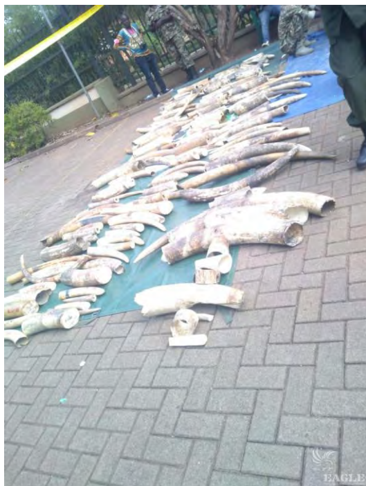
Despite new reforms, Uganda continues to be used as a wildlife trafficking hub. One ton of ivory was seized at Entebbe airport from alleged smugglers from West Africa in February 2017.

Based on estimates from seizures in Uganda and interviews with experts in Congo, South Sudan, and Uganda, large amounts of ivory from Garamba are transported to Uganda either through South Sudan or via Congo-Uganda border crossings. 6 Elephant ivory fetches up to $250 per kilogram ($113 per pound) in